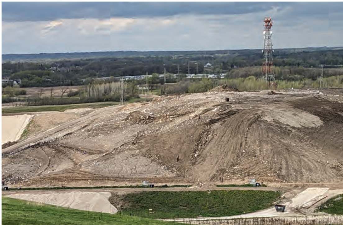
Crested cells, Phases 1 & 2 of North Expansion West