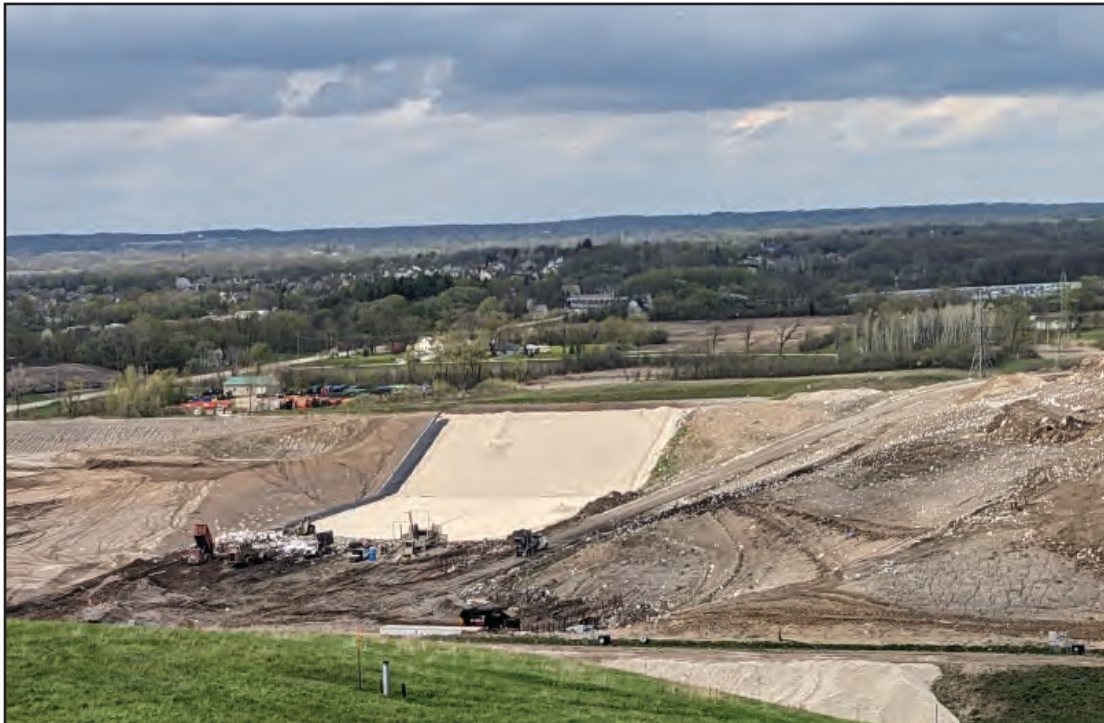
Fluff layer reaching ~70% of coverage