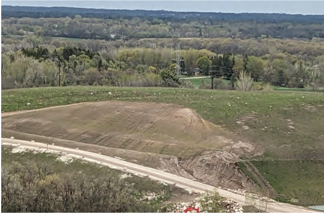
Access road now travels to soil stockpile and around preserved trees to working face