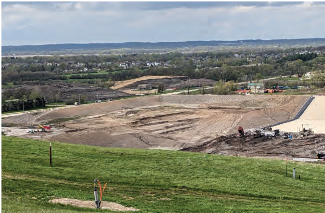
Future Phases of North Expansion West, minor excavation