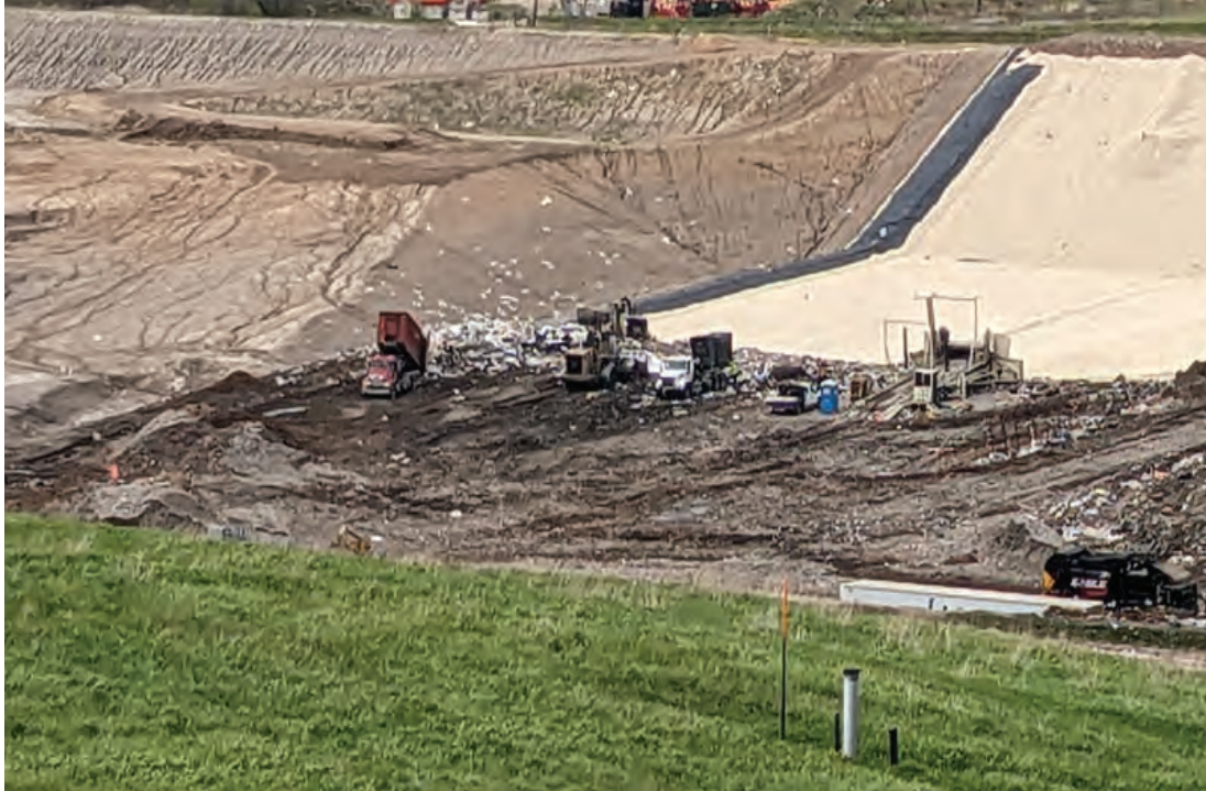
Fluff layer placement started at South end of New Cell and progressing Northward ~70% coverage