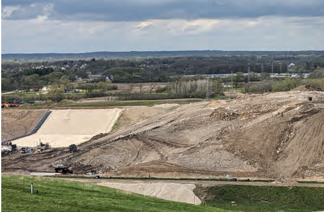
Phase 2 of North Expansion West, well covered