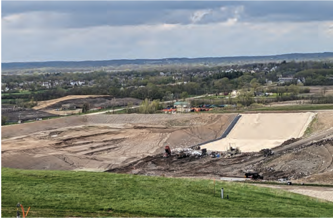
Overview of North Expansion West, new cell and future cell areas