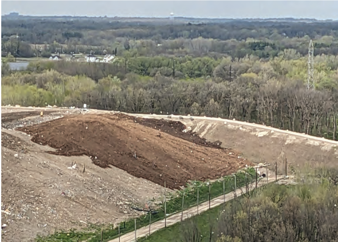
Compost being placed on East slope of North Expansion West for future seeding