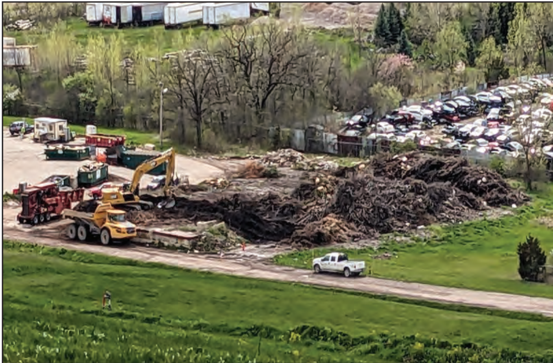
Green waste being ground during closed hours of the resi-drop-off